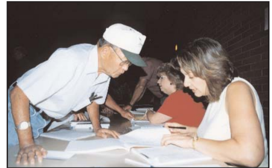
A landowner signs up for the Kings River ag discharge coalition during a meeting in Dinuba. The "Coalition Membership Election Form" can be downloaded at www.krkd.org .